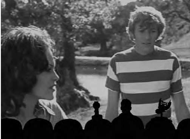
Figure I.1 Modelling reductive reception: The Touch of Satan (1971) receives plenty of historically chauvinistic mockery in a 1998 episode of Mystery Science Theater 3000 (1988–99).